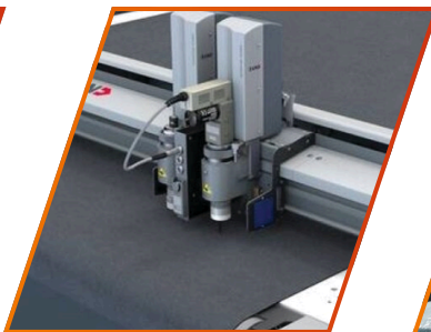
Prepreg Kit Cutting