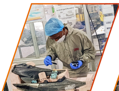
Bonding & Assembly