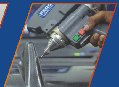
7- Axis laser Scanning