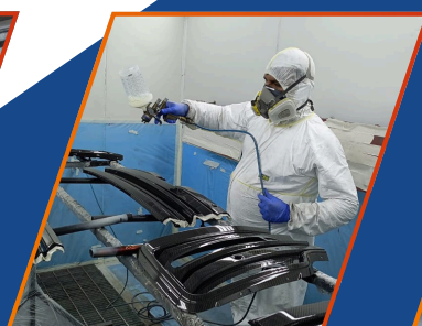
Painting & Coating